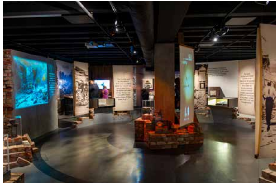
1931 Hawke's Bay earthquake gallery