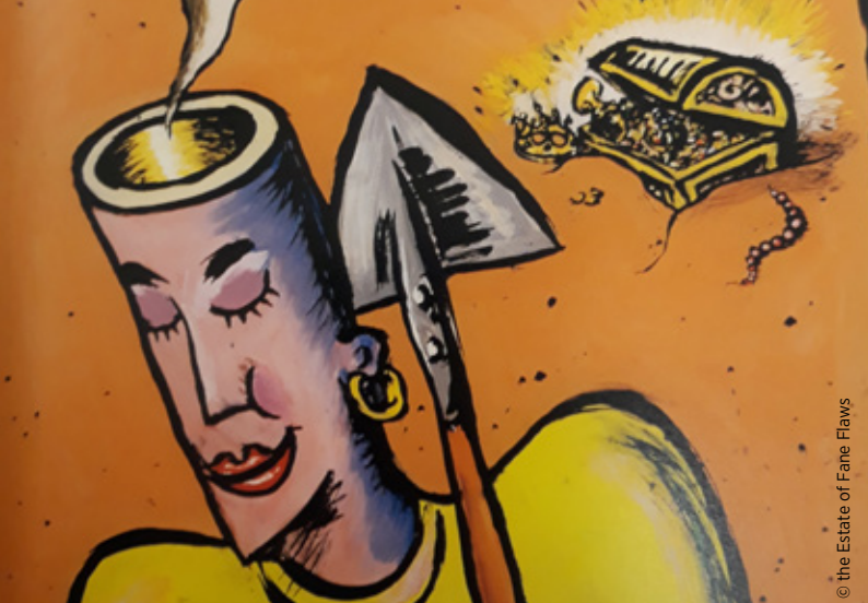
© the Estate of Fane Flaws